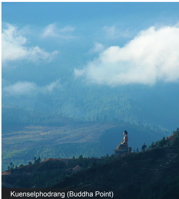
Kuenselphodrang (Buddha Point)