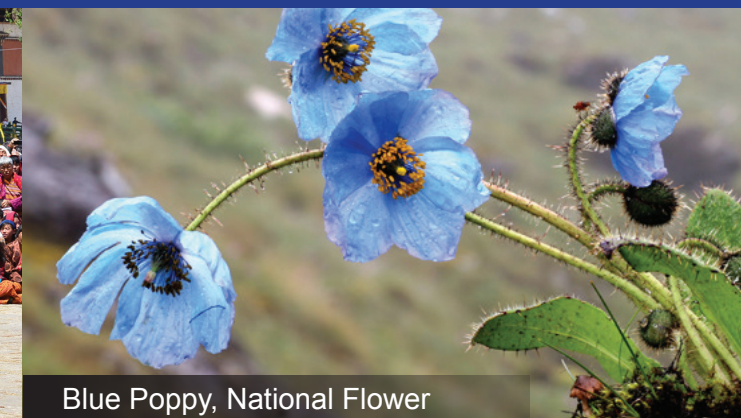
Blue Poppy, National Flower