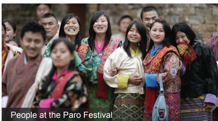
People at the Paro Festival